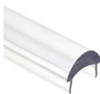
cover type S transparent (00220)