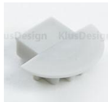
end cap without hole (1430) with hole (1448)