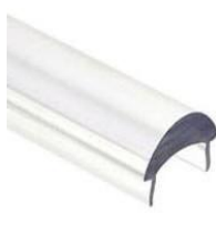
cover type S transparent (00220)