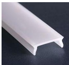
cover type K / KA-BIS frosted (1547/17071) transp. (1548/17072) cover type LIGER frosted matte (1547/17071)