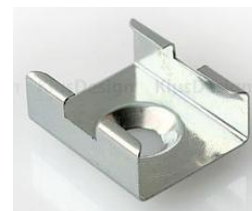
mounting bracket zinc (1399) chrome matt (1455)