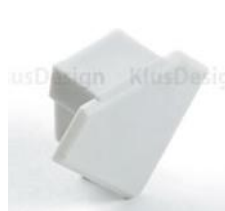
end cap without hole (1383) with hole (1440)